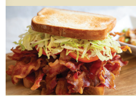
BLT Marathon Sandwich