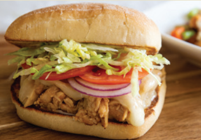
Kentucky Bourbon Chicken

lettuce, tomato, onion, green pepper, mushroom, cucumber & black olive.